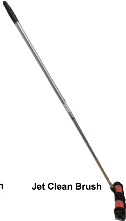
Jet Clean Brush

Dark Blue Hard Brush for removing spots & stains.