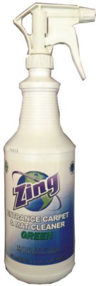
Zing Entrance Carpet & Mat Cleaner