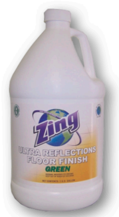
Zing Ultra Reflections Floor Finish