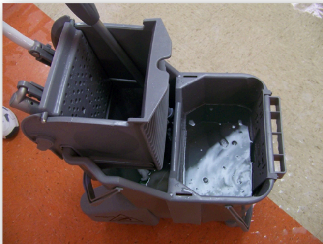
Step 8 - Rinse Floor