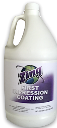
Zing First Impression Coating

Number of coats to be applied based on desired look.