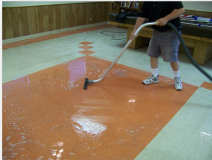
Step 7 - Wet Pick-up