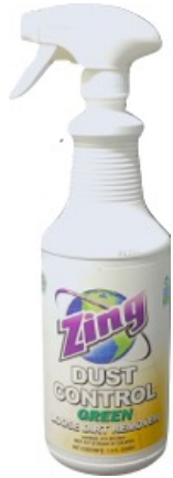
Zing Dust Control Qt. Bottle w/trigger sprayer