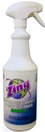
Zing Entrance Carpet & Mat Cleaner Qt. Bottle w/trigger sprayer